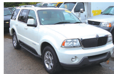
2004 Lincoln Aviator SUV Luxury, AWD. Payments as low as $199 a month.