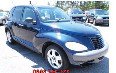
2001 Chrysler PT Cruiser 4 cyl, 23 MPG, power sunroof, leather, cruise, air. Payments as low as $99 a month.