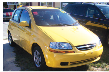
2008 Chevy Aveo 34 MPG on this yellow gas saver. Air, CD, one owner, 82K. Payments as low as $149 a month.