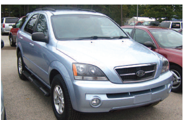
2005 Kia Sorento AWD. Payments as low as $99 a month.