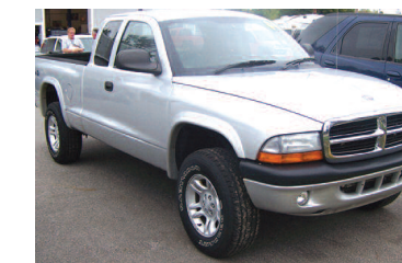
2004 Dodge Dakota 4x4 Ext Cab, Auto, 8 cyl, bedliner. Payments as low as $99 a month.