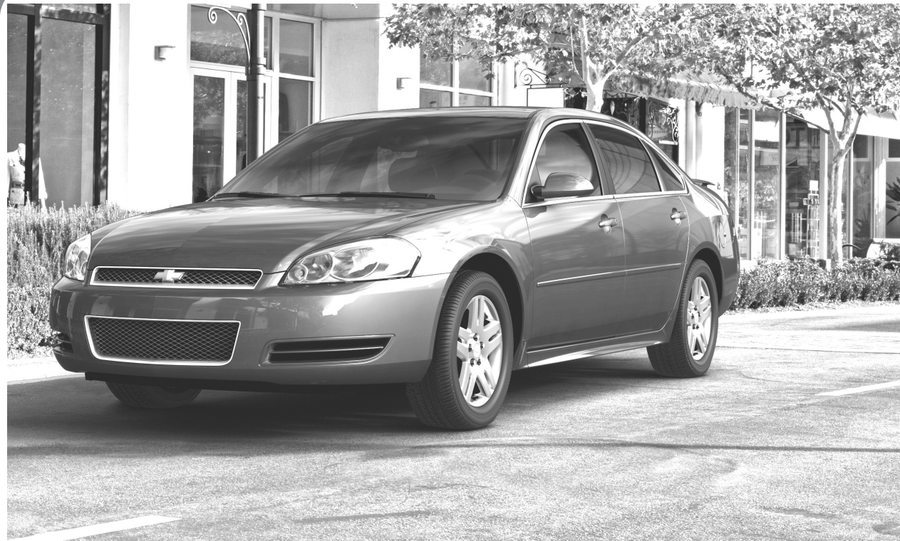
As Chevrolet prepares to make way for an all-new Impala for the 2014 model year, Chevrolet is offering a Luxury Edition Package on LT retail and fleet models for 2013.