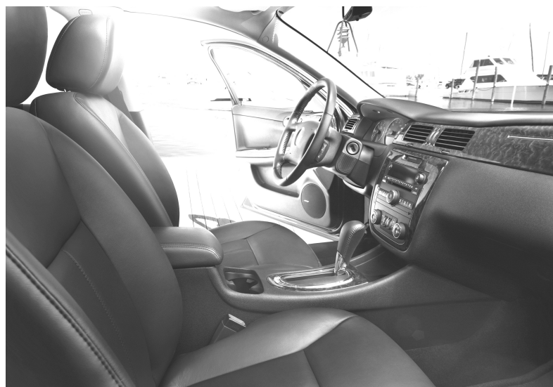
The Impala's exterior and interior convey sophistication, roominess and quality.

Safety begins with an enhanced structure that is designed to absorb crash energy