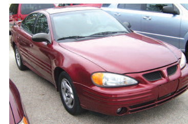
2002 Pontiac Grand Am 4 door, 4 cyl. Payments as low as $99 a month.