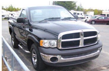
2002 Dodge Ram 4x4 Auto, tonneau cover, short box, bedliner. Nice truck! Payments as low as $99 a month.