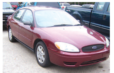
2004 Ford Taurus Great MPG in a mid size car. Payments as low as $99 a month.