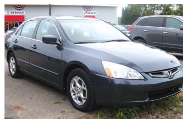
2003 Honda Accord LX 4 cyl. Loaded Payments as low as $99 a month.