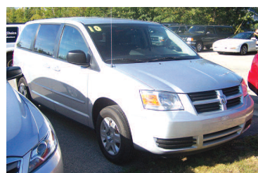
2010 Dodge Grand Caravan 4 captains chairs, Stow-N-Go seating. 71K. Payments as low as $249 a month.