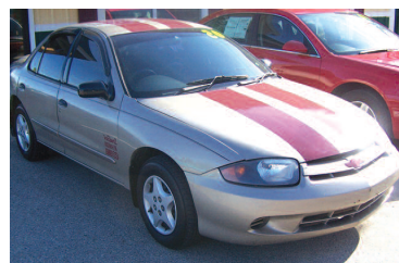
2005 Chevy Cavalier Street Glow Lights. Auto, tinted glass, air, cruise, 31 MPG. Payments as low as $149 a month.