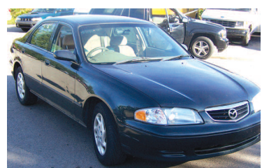
2002 Mazda 626 5 speed. Payments as low as $149 a month.