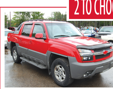
2002 Chevy AVALANCHES - Black & Red. Crew Cab 4X4, 8 Cyl. 5.3L. Great looking trucks. Payments as low as $199 a month.