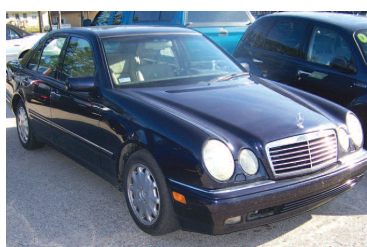
1997 Mercedes Benz E-320 25 MPG, 130K. Sale priced at just $5,995.